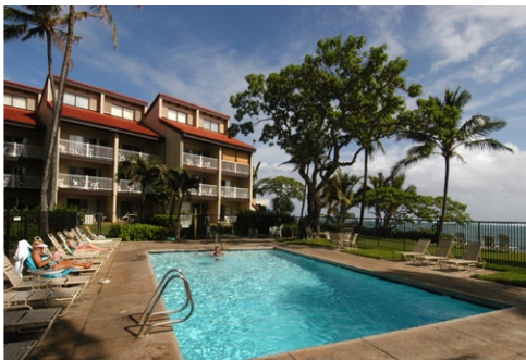
Photos are from a standard one-bedroom, ground floor unit

This property is not recommended for mobility-impaired guests because all unit entrances have at least three steps and the bathrooms and bedrooms are too small to accommodate even the smallest wheelchairs. A wheelchair could possibly gain access to the living room and kitchen area of one-bedroom, ground floor units by entering through the sliding glass patio doors and crossing a threshold that is between 2" and 5" high.