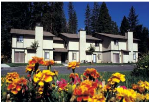
Photos are from special needs two-bedroom unit

No non-special needs units are recommended for mobility impaired guests because all units have two floors with both bedrooms and the accessible bathroom are located upstairs.