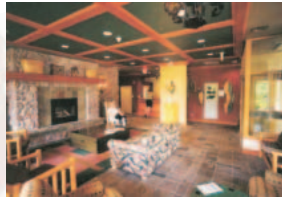
WORLDMARK CASCADE LODGE.

Bear Lake, UT Big Bear, CA Birch Bay, WA Branson, MO Cascade Lodge, British Columbia Clear Lake, CA La Paloma, Mexico Reno, NV Steamboat Springs, CO Sundance, British Columbia Wolf Creek, UT