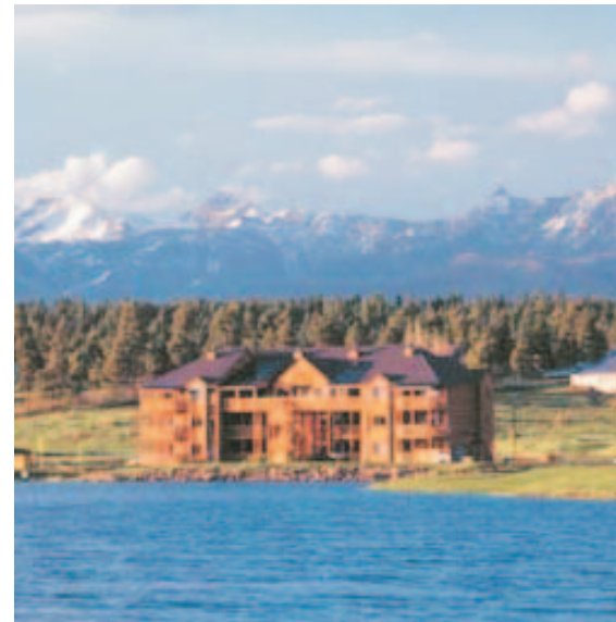
OPPOSITE PAGE FROM TOP: Hot air ballooning at Wolf Creek. THIS PAGE FROM TOP: Fairfield Pagosa Springs on Village Lake. Festive downtown Steamboat Springs at the holidays. Thousand Hills Golf Course in beautiful Branson.

I find my way back to U.S. 54 towards Jefferson City, crossing the Missouri River and catching U.S. 63 through lake-filled north Missouri into Iowa, zigzagging past the Des Moines River, William Penn College and old pioneer farms to I-80. Past Davenport, I switch to U.S. 61, heading up into Dubuque where I connect to U.S. 20, crossing east into Illinois and into the primordial beauty of WorldMark Galena .