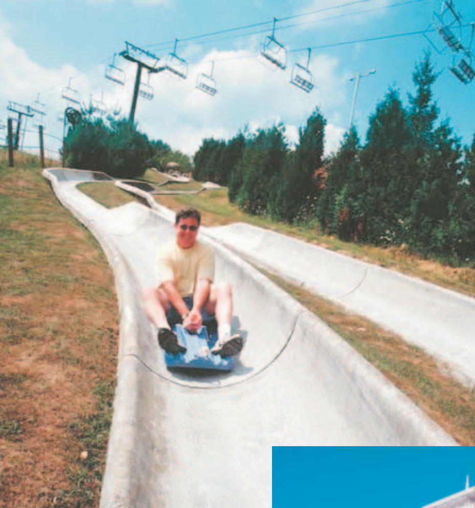
OPPOSITE PAGE FROM TOP: Cozy comfort with verdant view; The welcoming front entrance of WorldMark Galena. THIS PAGE FROM TOP: Ski in winter and alpen-slide in summer all the way down to the Mississippi at Chestnut Mountain; Beautifully restored Belvedere Mansion built in 1857.

White Sox. An entire industry has sprouted up since the film crews left, and here you can run the bases, navigate the corn maze, purchase souvenirs and cheer the Ghost Players, a baseball team composed of many of the original cast members who might even invite you to step up to bat.