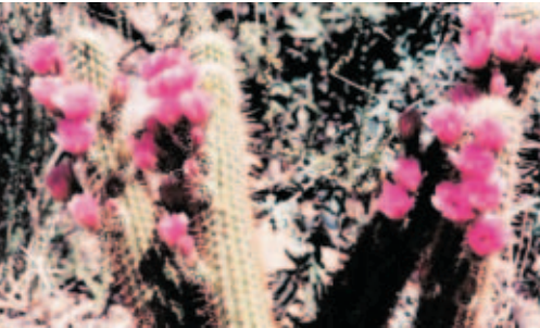
ARIZONA-SONORA DESERT MUSEUM