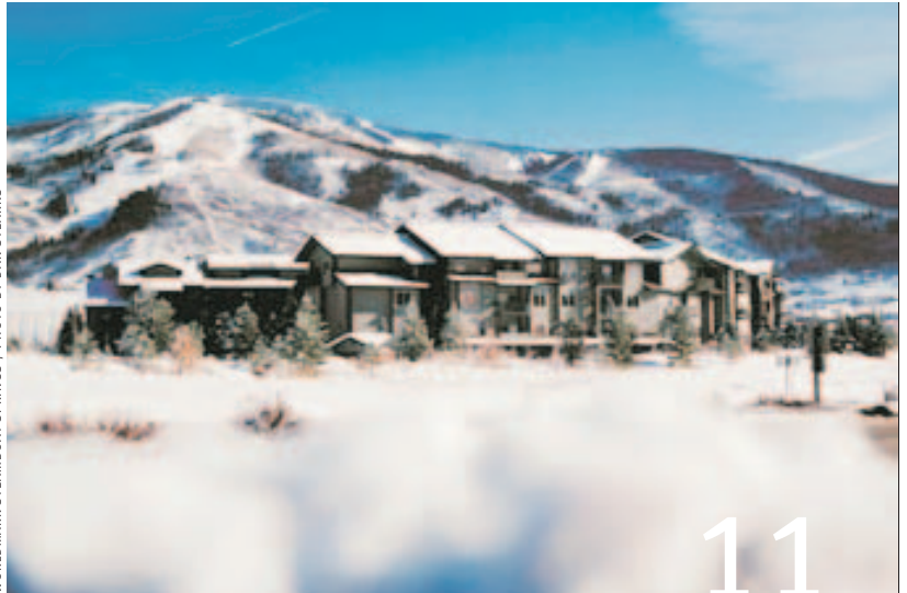
WORLDMARK STEAMBOAT SPRINGS / PHOTO BY DAN STEARNS